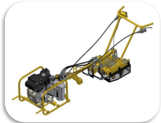
Dedicated unit – FP-156-EPSE